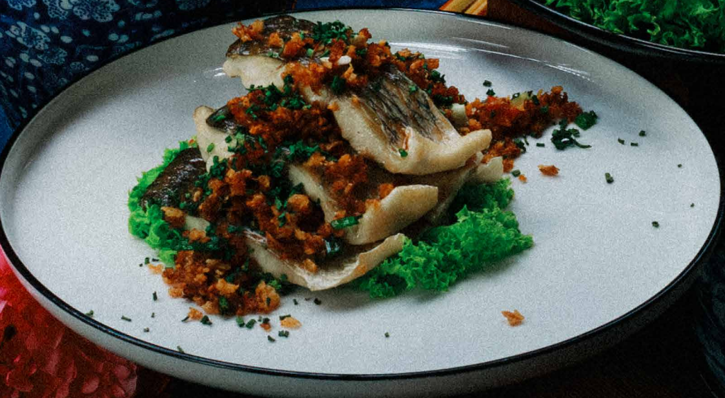
STEAMED BARRAMUNDI WITH "CHAI POH" PRESERVED RADISH