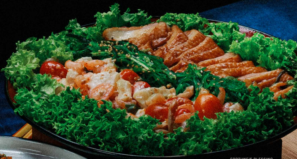
FORTUNE'S BLESSING COLD PLATTER