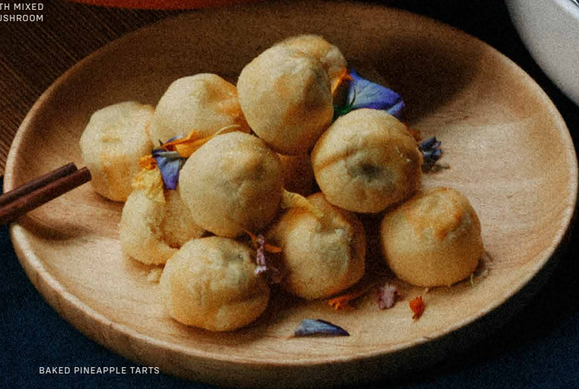
BAKED PINEAPPLE TARTS