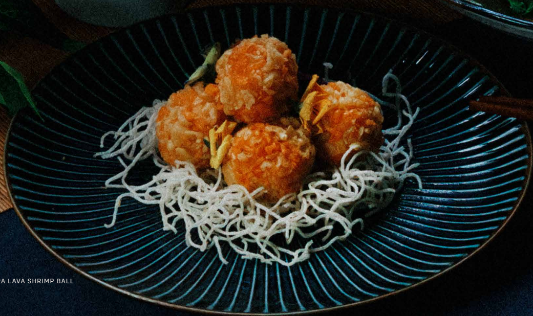
TEMPURA LAVA SHRIMP BALL