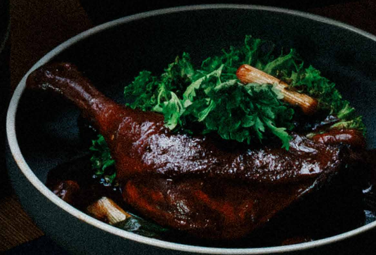
TEOCHEW BRAISED DUCK LEG WITH CHESTNUTS