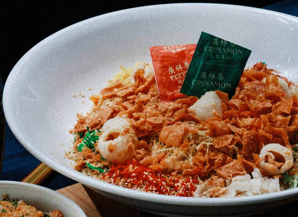
FOUR SEASONS' PROSPERITY YUSHENG