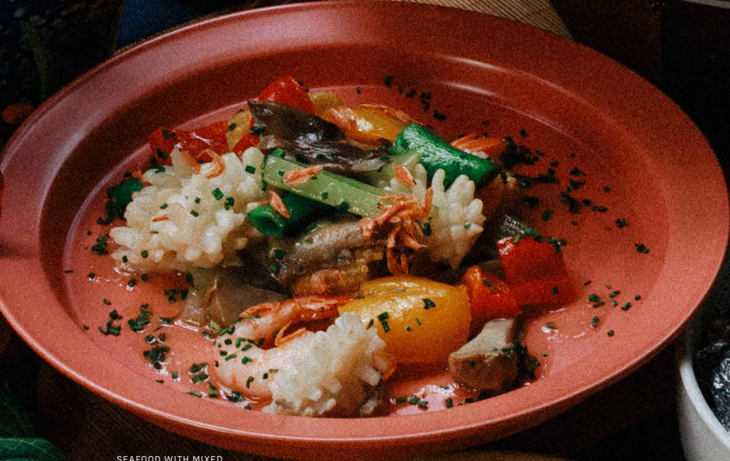
SEAFOOD WITH MIXED VEGETABLES & MUSHROOM