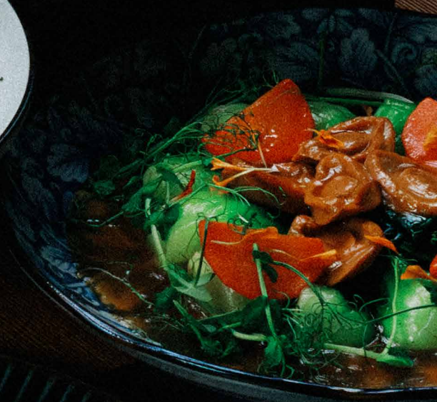
STEAMED SHANGHAI GREEN WITH ABALONE