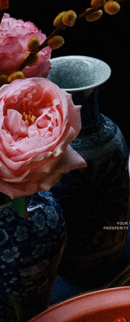
FOUR SEASONS' PROSPERITY YUSHENG